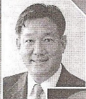
Mr. Kittiratt Na-Ranong Deputy Prime Minister and Minister of Finance, Thailand