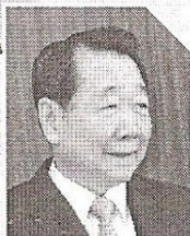
Mr. Dhanin Chearavanont Chairman and CEO Charoen Pokphand Group Company Limited, Thailand

Athenee Crystal Hall Plaza Athenee Bangkok Hotel Friday, July 27, 2012