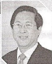
Mr. Jose Isidro Camacho Former Secretary of Finance, the Philippines